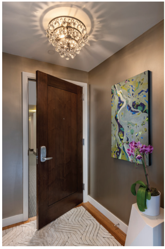
LEFT: The ceiling light shines a pattern on the ceiling while the textural rug design foreshadows spaces to come; the pedestal provides surface space

Employing elements like dramatic lighting and gauzy drapery to make the most of the skyline views, Taylor selected furnishings at once elegant and artful without being stuffy - there are grandchildren, after all. The palette could be described as "pebble" with shimmering organic accents that combine in a subconscious shoreline aesthetic.